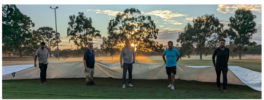
Early morning Volunteers make Cricket possible